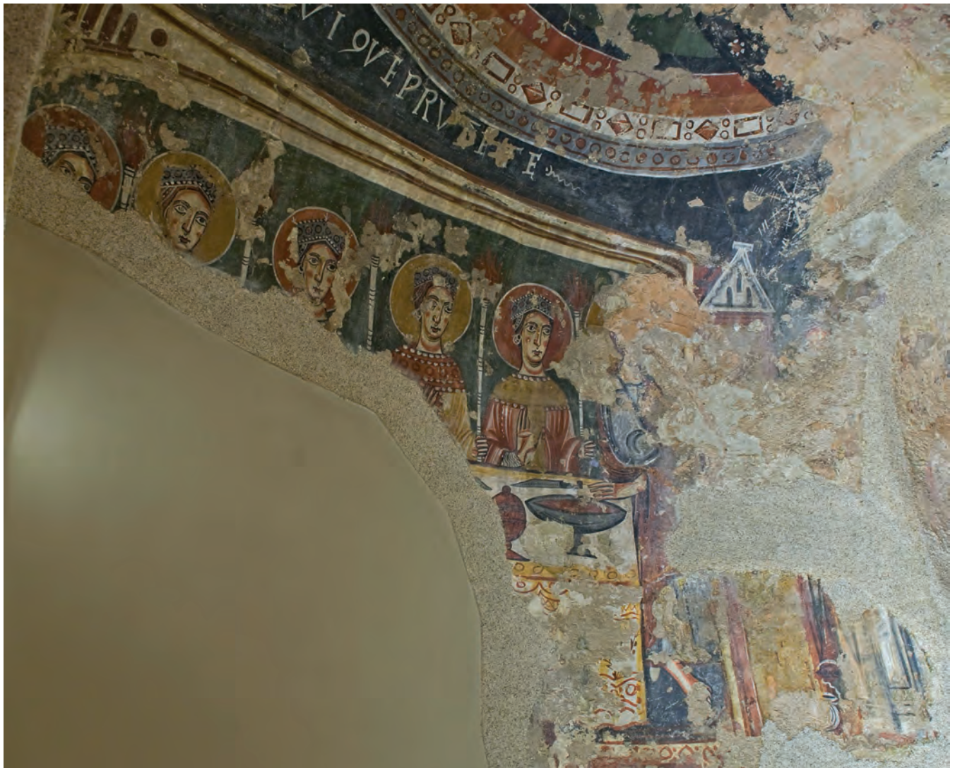
Figure 1. The wise virgins in the southern apse of Sant Quirze de Pedret, MNAC.

However, the style is not the only thing that is extraordinary in Pedret; so is the iconographic programme. 5 The