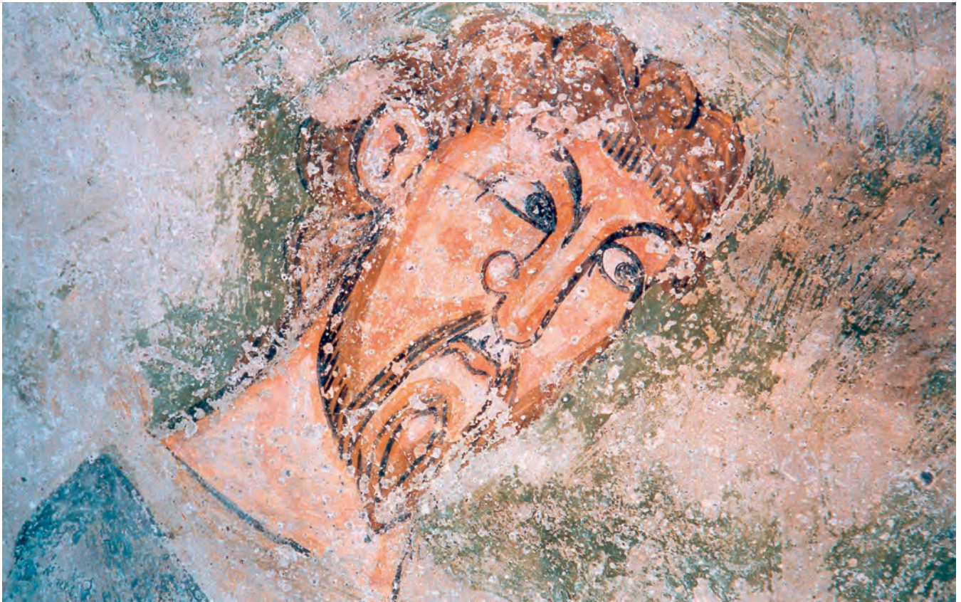
Figure 6. The face of Cain in the scene depicting the Fratricide, paintings from Sant Climent de Taüll, in situ (© Centre de Restauració de Béns Mobles de Catalunya. Photo: Carles Aymerich).

be related to Santa Maria de Taüll. In these paintings, three different styles converge: a Lombard style, quite different to that of Pedret and yet very high quality; a more expressionistic style; and a third much more rudimentary style, even in the polychromy. They all date from around the same period, which would indicate that painters from different places had joined forces to complete the commission. Something similar holds true in Santa Eulàlia d'Estaon. 33 In Sorpe, the best master is the first one, the author of the Annunciation and the Crucifixion, with a lovely Christ that reflects the mezzo-Byzantine style. 34 This artist also painted the Crucifixion in Santa Eulàlia d'Estaon (MDU and private collection), 35 which is almost identical to the one in Sorpe, where we can note the use of the same patterns, for example. The second master of Sorpe rendered Saints Gervasius and Protasius and the allegorical images on this church's triumphal arches, including the picture of Mary with the Christ Child between the Church and Synagogue, which has been studied by Hélène Toubert 36 (very stylistically similar to the Maiestas Mariae in Santa Maria de Taüll) as well as the Bark of the Church and the banquet of the wealthy man from the parable of Lazarus, which is from a chapel located on the first floor of the belfry. Finally, the third master of Sorpe, the most mediocre one, painted the Eucharistic, theophanic and zodiacal figuration of the arches separating the naves, al-