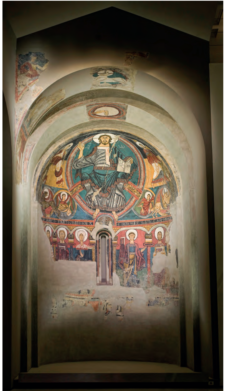
Figure 5. Apse of Sant Climent de Taüll, MNAC.

zoomorphic symbols of the evangelists. In all of them, one can note a certain classical influence from Lombard painting. The decoration in the nave, which was painted after the church was consecrated, is by yet another artist, freed from the weight of the Byzantine-Lombard heritage and its ancient naturalism, the Master of the Final Judgement, who imitates the great local masters, both the Master of