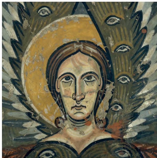
Figure 2. Close-up of the seraphim in Santa Maria d'Àneu, MNAC.

In Catalonia, the Pedret style reappears in an entire series of churches whose decoration dates from the end