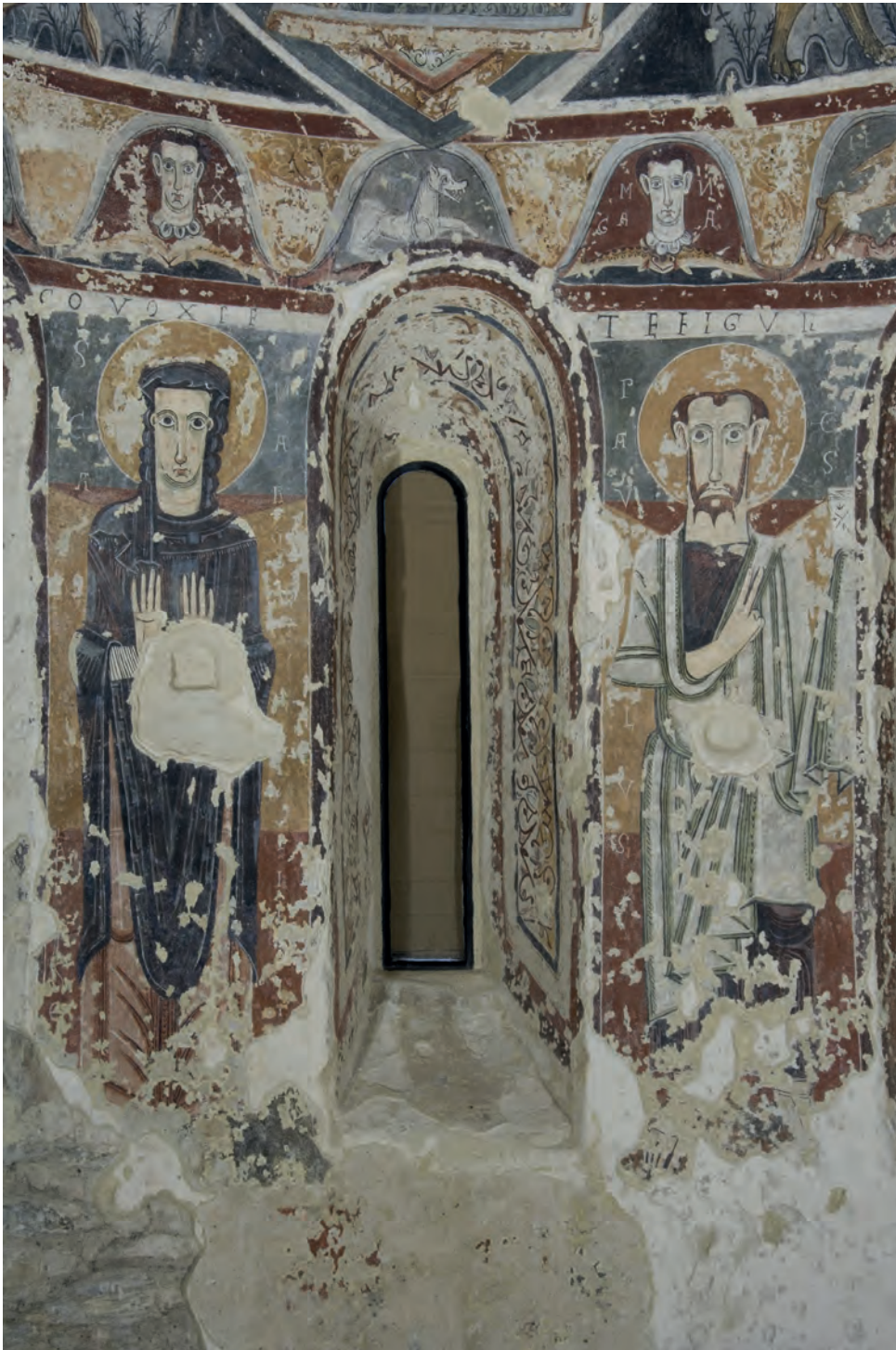
Figure 3. The Virgin Orans and Saint Paul and the “sea of glass”, with the quotation from the Apocalypse in the apse of Sant Vicenç d’Estamariu, in situ (© Centre de Restauració de Béns Mobles de Catalunya. Photo: Carles Aymerich).

sites, which also relates them to the paintings in Sainte-Marie de la Clusa, the ones in St. Martin de Fenollar and the severely damaged remains in Sant Quirze de Colera in the Alt Empordà, which have only recently been discovered and are still unpublished. However, except for this primordial relationship, the frescoes in Mur would still be a unicum if the ones in Sant Miquel de Moror, 23 a church which depended on the canonic church of Mur, had not been conserved, albeit in a highly fragmented fashion.