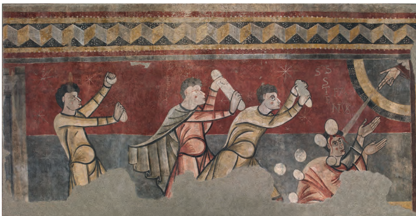
Figure 4. Lapidation of Saint Stephen from Sant Joan de Boí, MNAC.